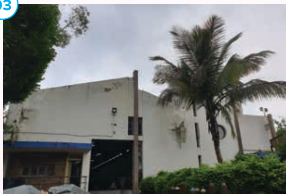
Location: D-4, MIDC, HINGNA, NAGPUR – 440016 (M.S.) INDIA