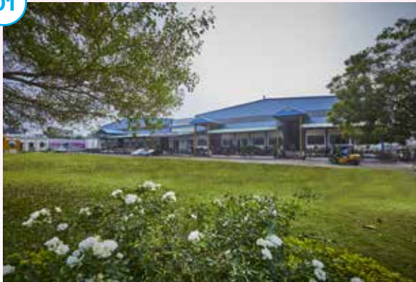
Registered Office: C-108, MIDC, HINGNA, INDUSTRIAL AREA, NAGPUR – 440016 (M.S.) INDIA