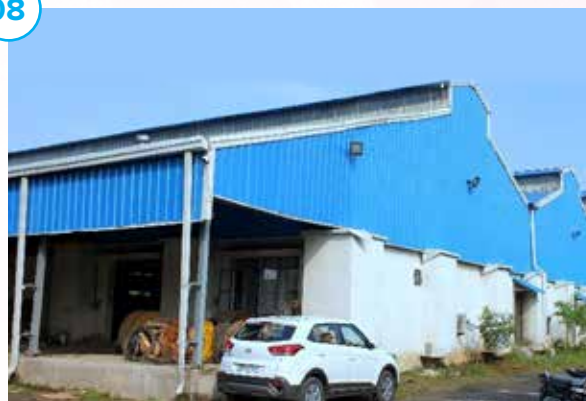
Location: Plot No. XI-73, MIDC, HINGNA, NAGPUR – 440016 (M.S.) INDIA