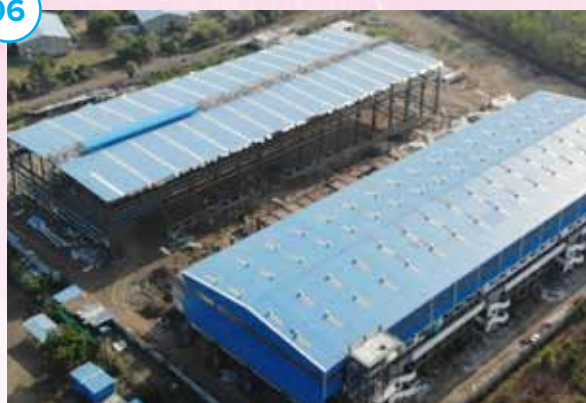
Location: Plot No. G-108, BUTIBORI MIDC, NAGPUR (M.S.), - 441108 INDIA (Factory Under Construction)