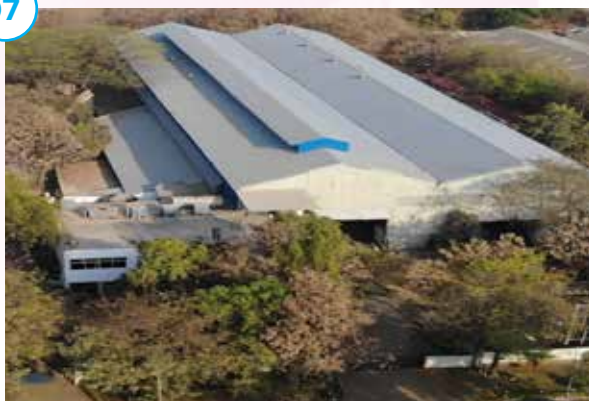
Location: G-10, MIDC, HINGNA, NAGPUR – 440016 (M.S.) INDIA