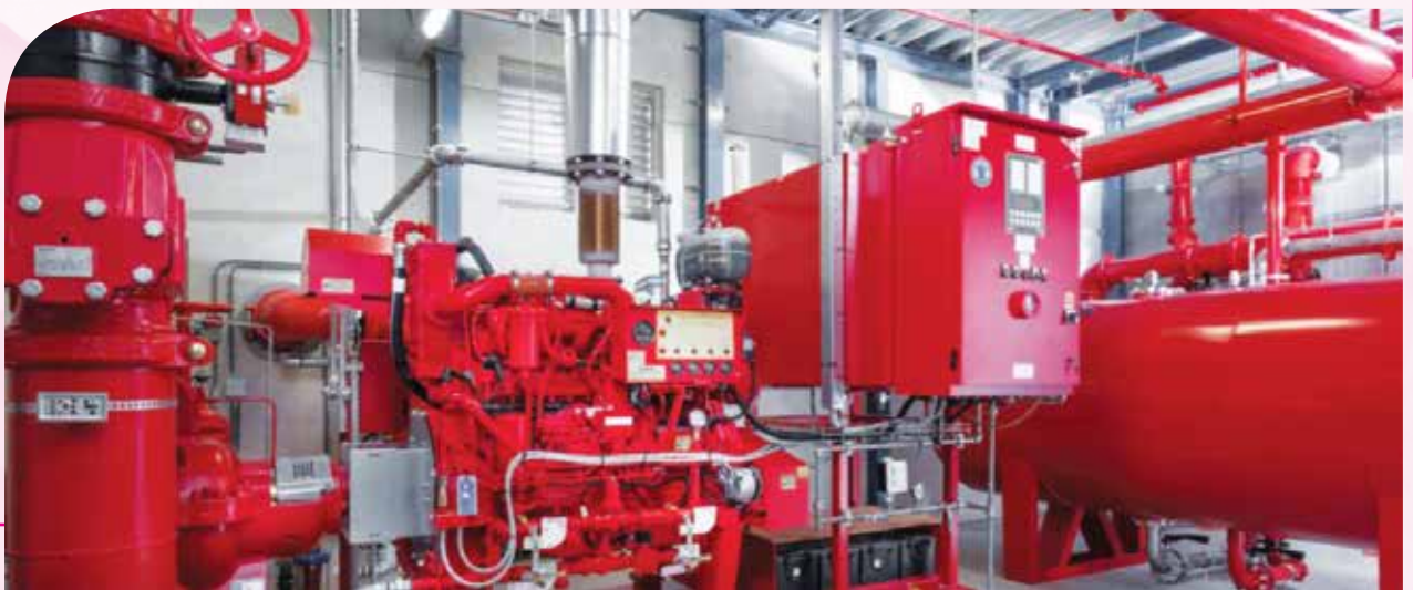
Fire Fighting & Hydrant Systems