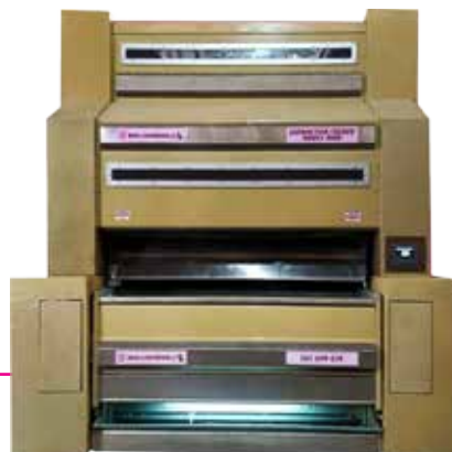
Saw Gin with Feeder Machine