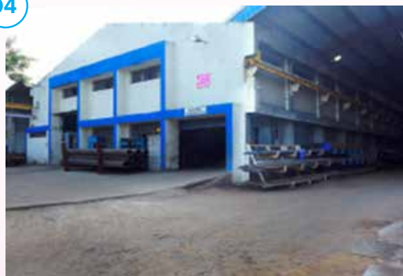
Location: D-5/2, MIDC, HINGNA, NAGPUR – 440016 (M.S.) INDIA