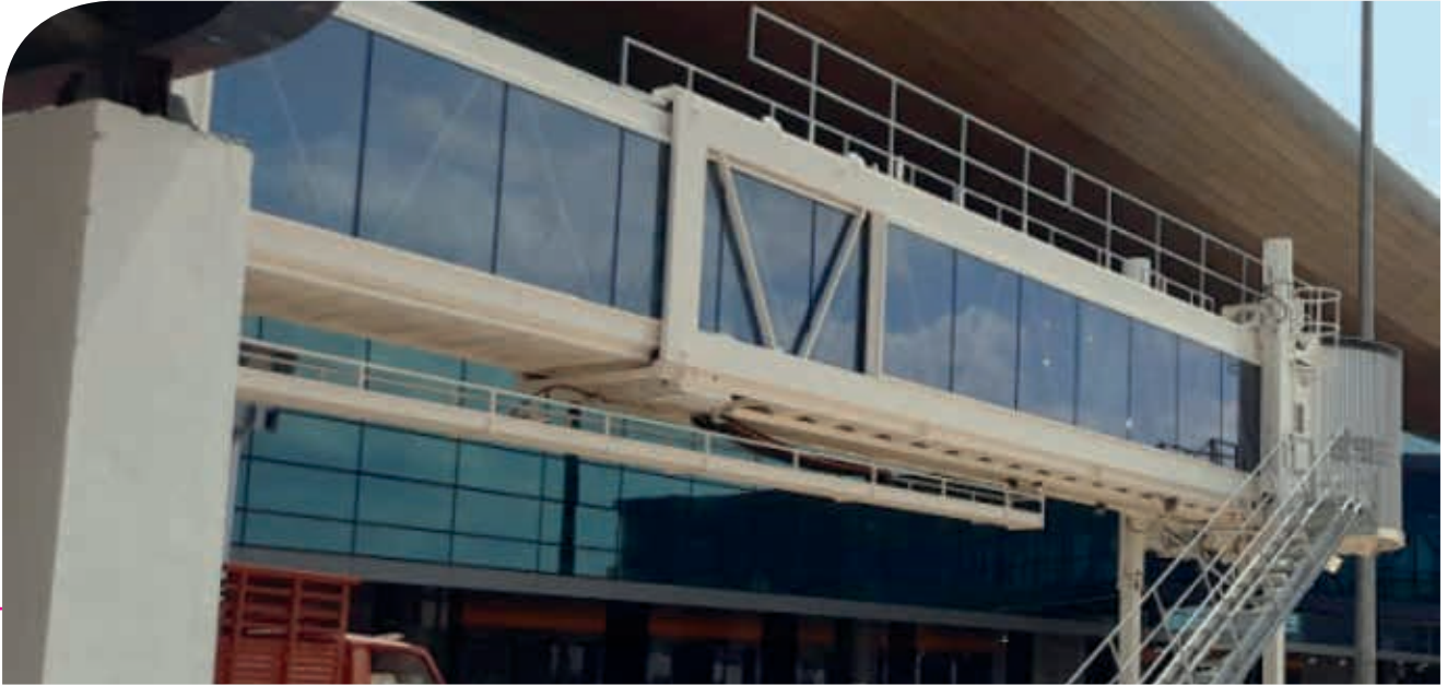
Passenger Boarding Bridge