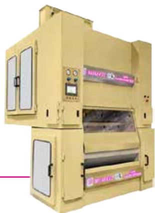
Phoenix Rotobar Machine