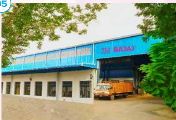
Location: G-6 & G-7, MIDC, HINGNA, NAGPUR - 440016 (M.S.) INDIA