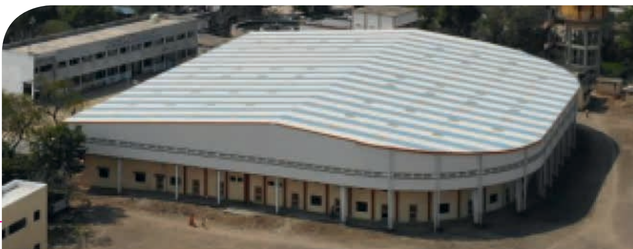
Pre-Engineering Building (PEB)