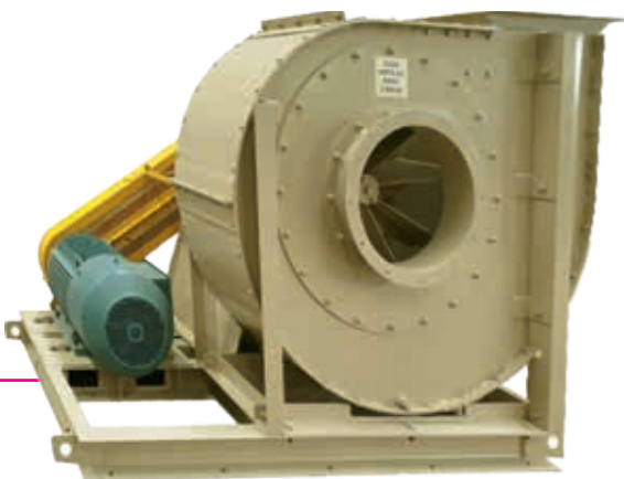
Centrifugal Fans & Blowers