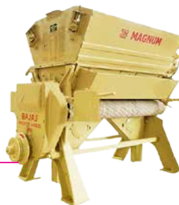
Advanced Double Roller Ginning Machines