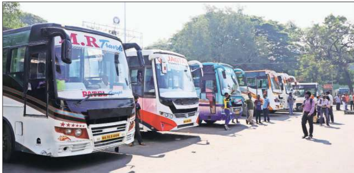
Private buses wait for passengers at the Swargate bus station premises on Friday.

"I had gone to my hometown for Divali and my leave ended on Wednesday. Since the strike was on, there was no ST bus from Nashik to Mumbai. I had to pay Rs 800 for the private vehicle,"