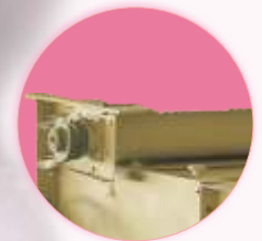
With CDS Trash Screw Conveyor