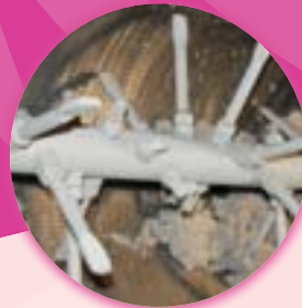
Top Beater Chamber for Linter Recovery