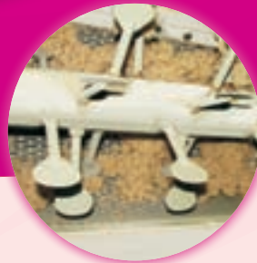
Bottom Beater Chamber for Pepper Dust Removal

BAJAJ-CEC LC 410D is uniquely designed with the paddle sections capable of handling capacities in excess of 10 tons per day of recovered linter. The cellulose yield of removed linter is maintained at maximum. The linter cleaner accommodates automatic screen cleaning at desired intervals. The LC-410D provides additional cleaning where it's needed the most, three times the effective pepper section cleaning than the competitors.