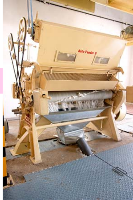
A photograph of DR Gin with Lint Suction System from Each Gin.