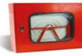
fire hose box