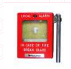
Manual Call Points

Fire detectors are designed to detect 1 or more of the 3 characteristics of fire – smoke , heat and flame . The detection system also includes call points, alarm sounders, addressable panels etc to arrest the attention .