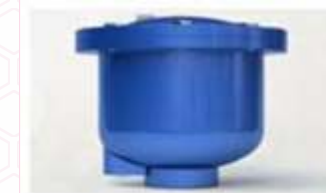
air release valve