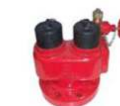
Two Way Breaching Inlet Breaching