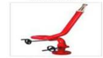
Stand Post Type Water Monitor