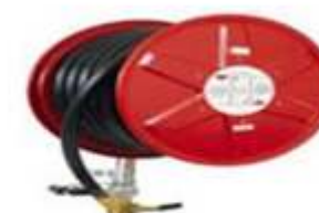
Hose Pipe Reel