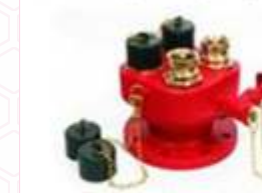
Four Way Inlet Breaching