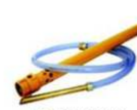
monitor foam branch pipe