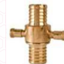
Fire Hose Delivery Coupling