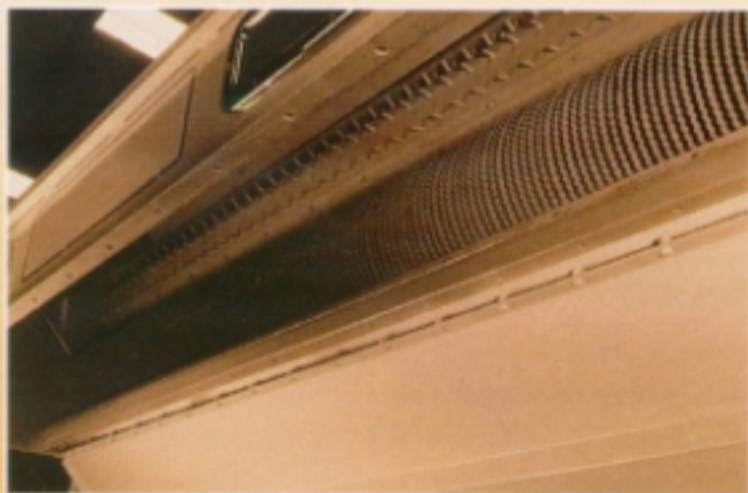
Front View of Serrated Discs