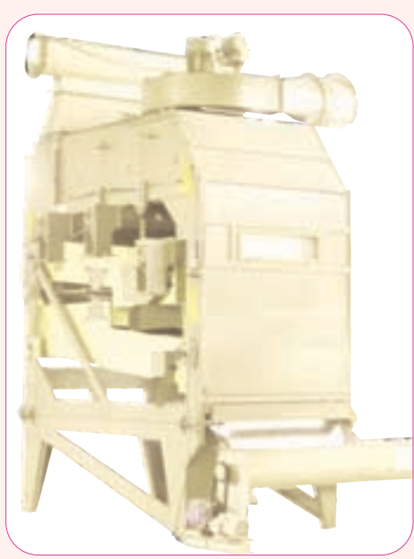
Seed Cleaner Assembly