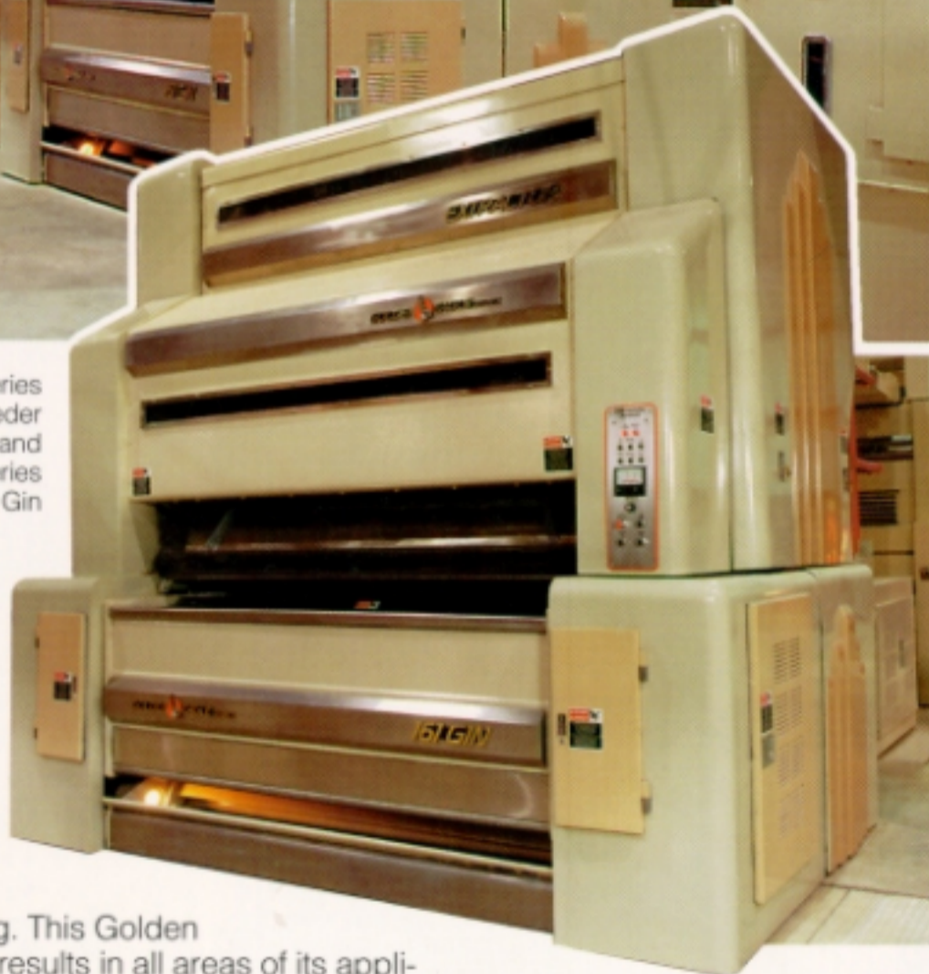
Golden Eagle Series Extractor/Feeder and Golden Eagle Series 161 Saw Gin