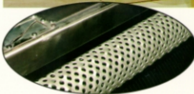
SEED ROLL CONVEYOR TUBE Seed is efficiently removed from the center of the seed roll.