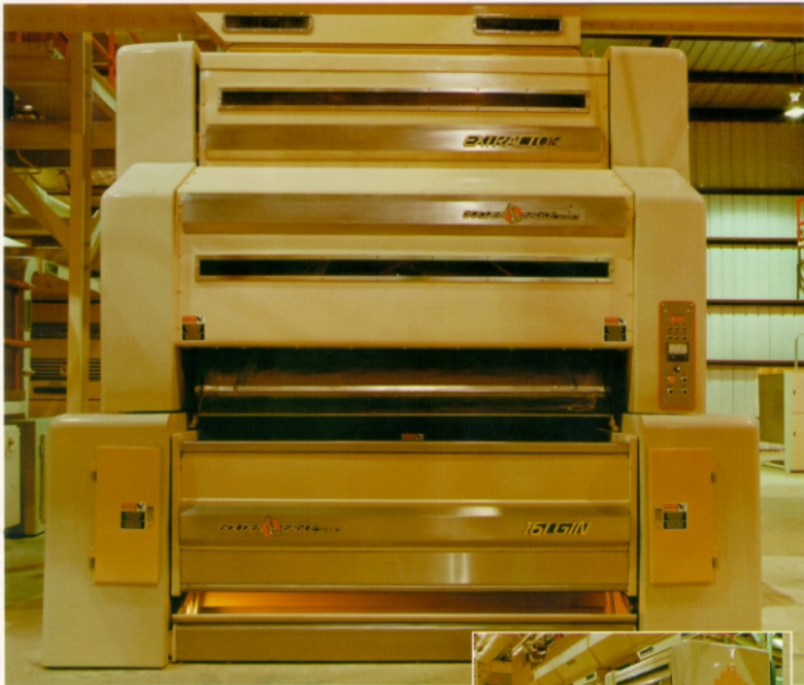
Golden Eagle Feeder and 161 Saw Gin