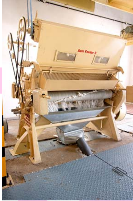
A photograph of DR Gin with Lint Suction System from Each Gin.