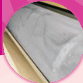
Bottom Beater Drum with removable screen

Unsurpassed in efficiency, the model 4620 Hull Beater is uniquely designed with a built in tailing beater eliminating the need for additional conveying systems. Capable of handling capacities in excess of 200 tons per day of delinted & undelinted cottonseed, the model 4620 is unequalled in the industry. When combined with the CEC/BAJAJ decorticator /separator system, oil in hulls is maintained at a low level by residual meat recovery to maximum extent, even with 12 % to 14% lint on hulls.