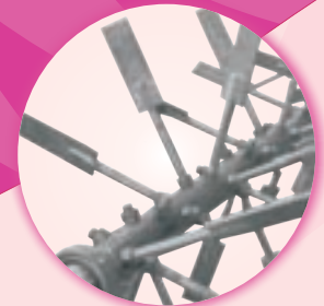
Top Beater Chamber Paddle Roller