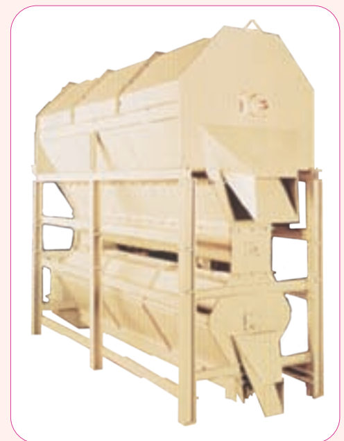
Hull Beater Assembly