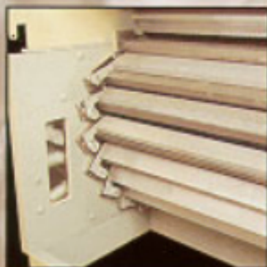
The LouverMax 24-D features 7 individually controlled louvers

Manufactured and sold exclusively by Continental Eagle Corporation. US Patent Number 5,909,786