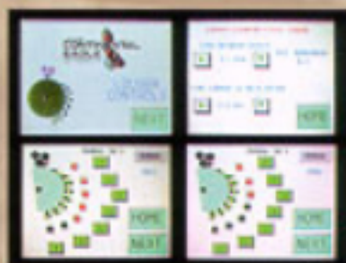
Touch screen quality control is as easy as 1, 2, 3: Automatically or manually activates each louver to suit your desired ginning results

LouverMax - the first of our new EagleMax Series and the number one pick of cotton producers worldwide. Contact us for the LouverMax equipped gin nearest you.